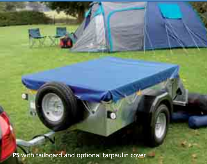
P5 with tailboard and optional tarpaulin cover