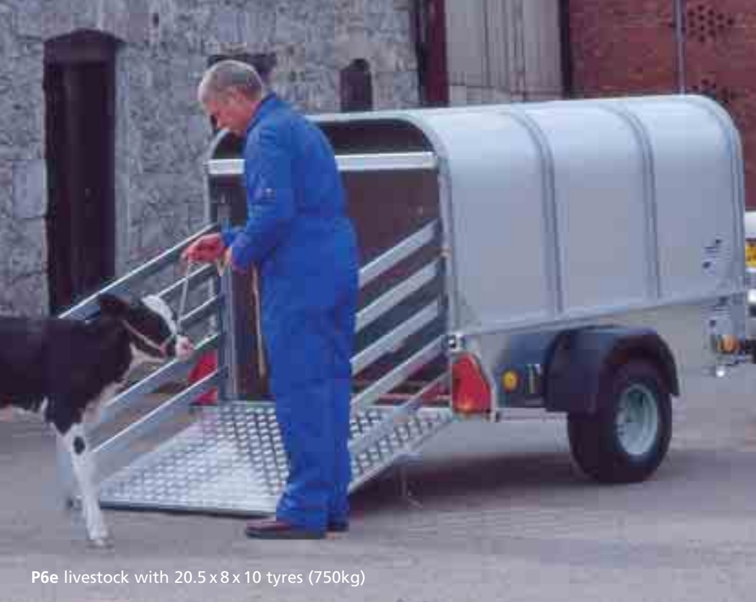
P6e livestock with 20.5 x 8 x 10 tyres (750kg)