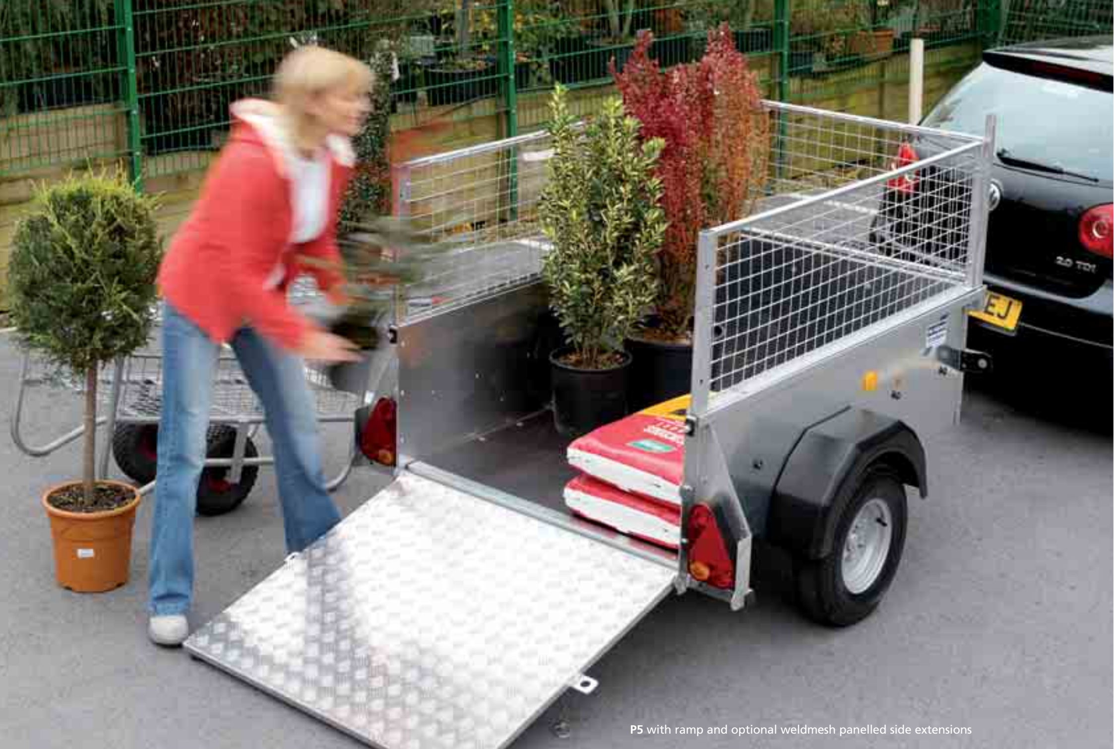
P5 with ramp and optional weldmesh panelled side extensions