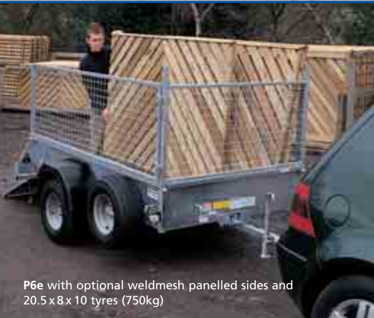
P6e with optional weldmesh panelled sides and 20.5 x 8 x 10 tyres (750kg)