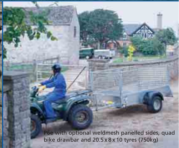
P6e with optional weldmesh panelled sides, quad bike drawbar and 20.5 x 8 x 10 tyres (750kg)