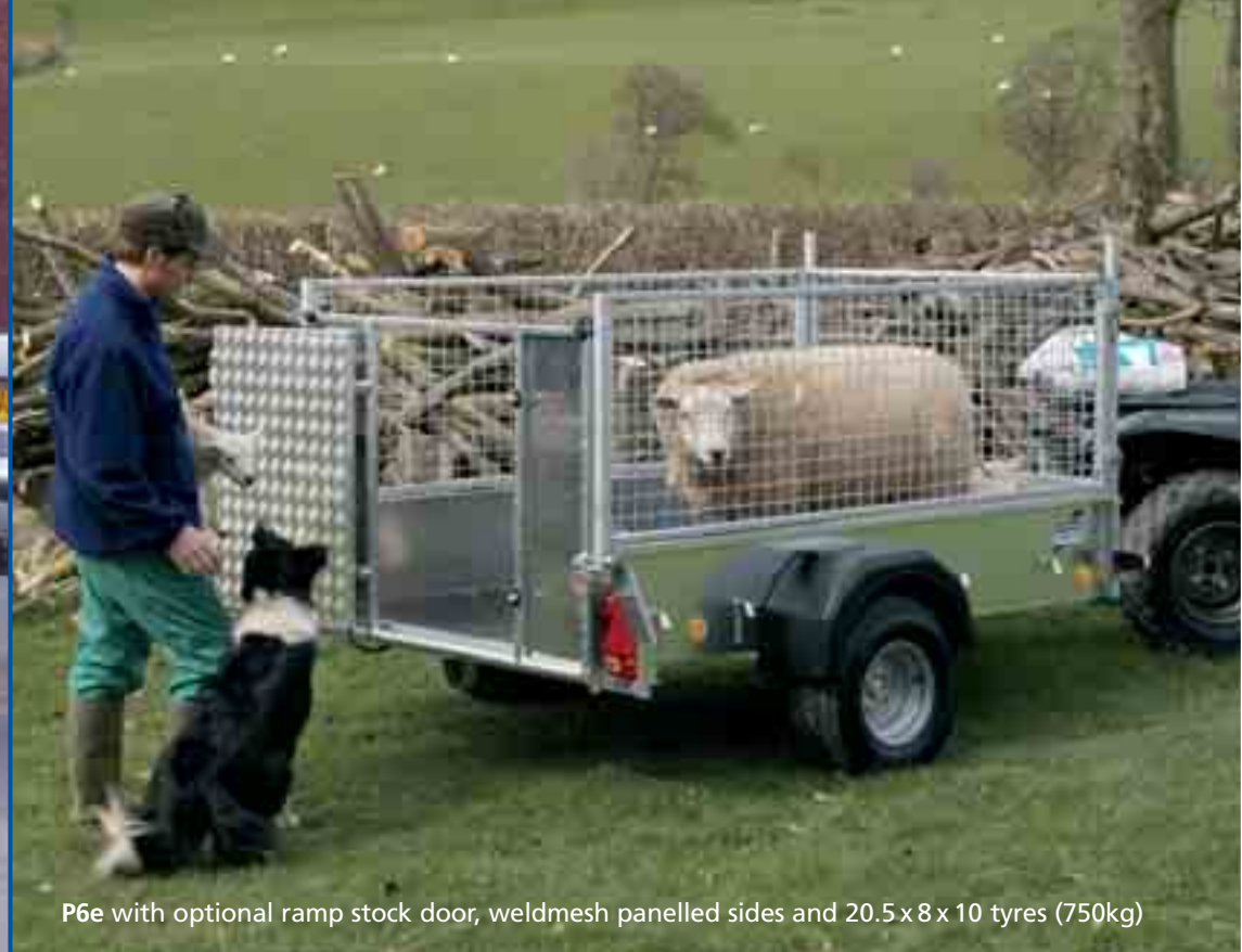
P6e with optional ramp stock door, weldmesh panelled sides and 20.5 x 8 x 10 tyres (750kg)