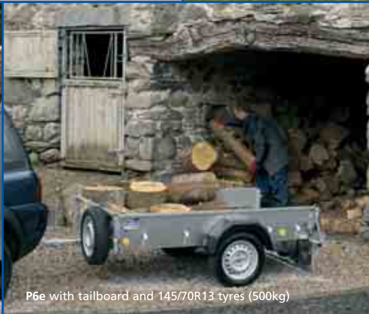
P6e with tailboard and 145/70R13 tyres (500kg)