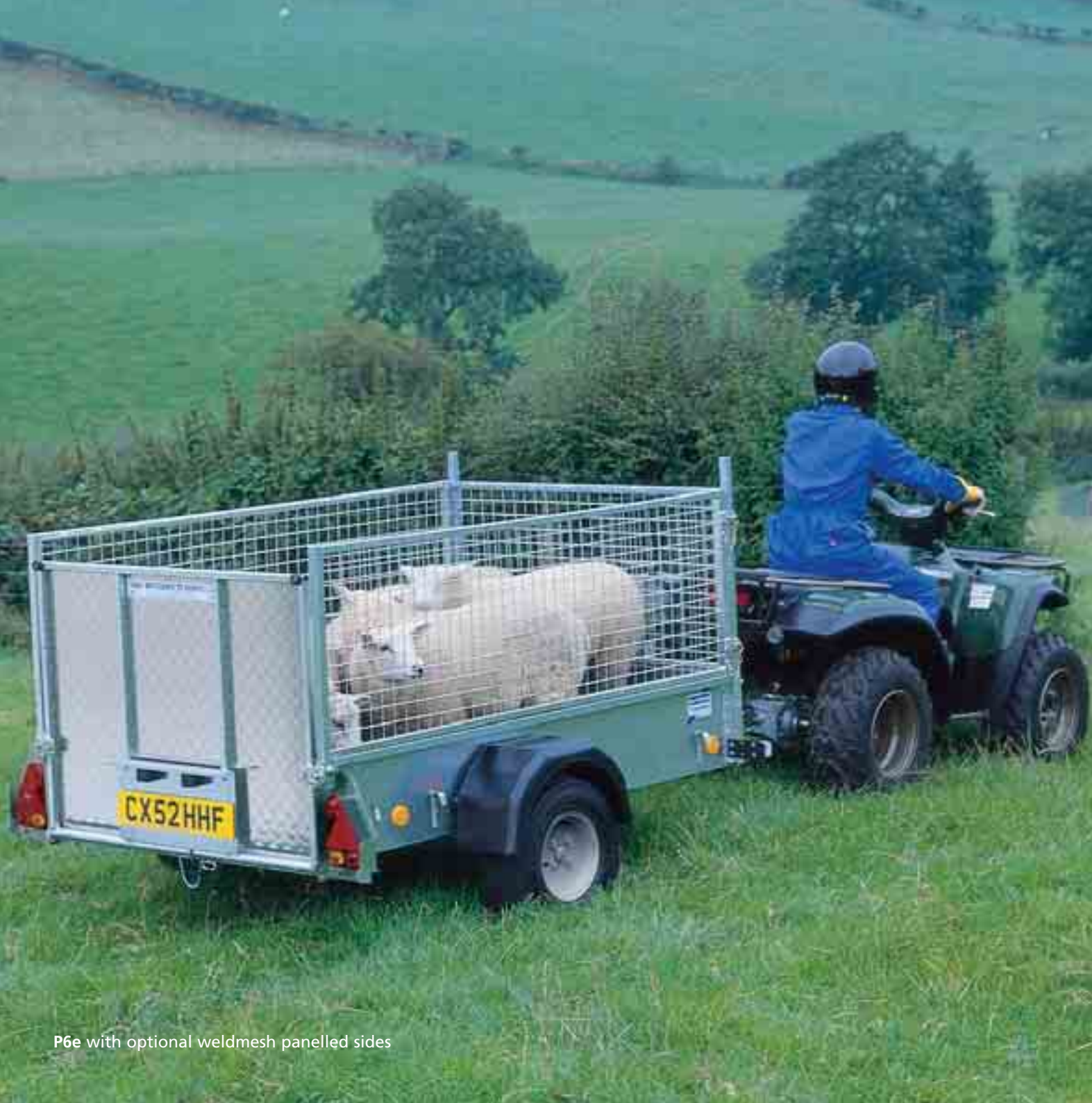
P6e with optional weldmesh panelled sides

Unbraked trailers are not subject to any of the towing restrictions placed on new car drivers* making them ideal starter trailers for those who have recently passed their driving test. Always refer to the towing vehicle manufacturers handbook for maximum unbraked towing limit.