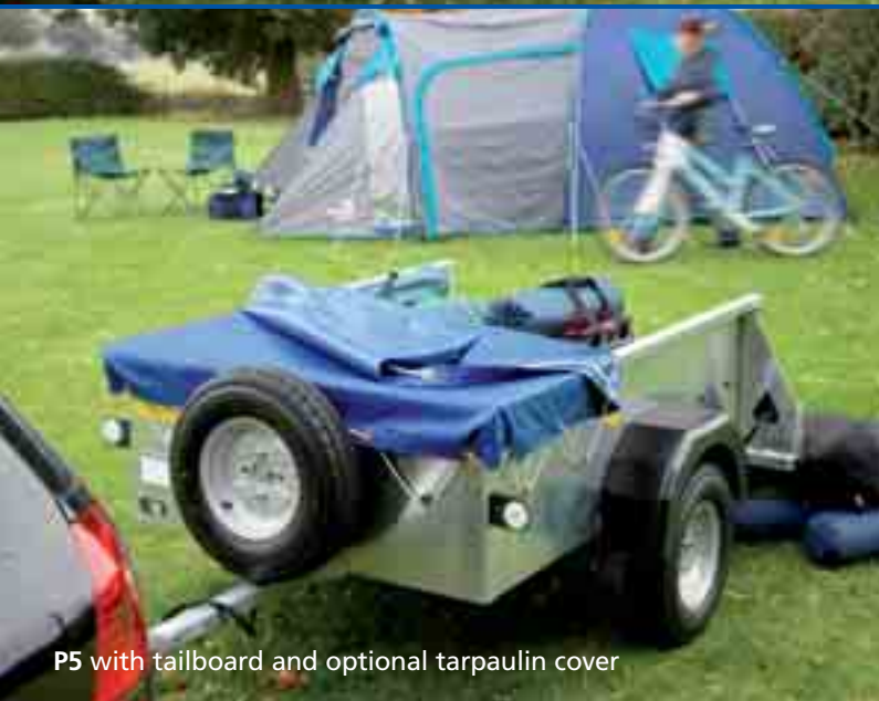
P5 with tailboard and optional tarpaulin cover